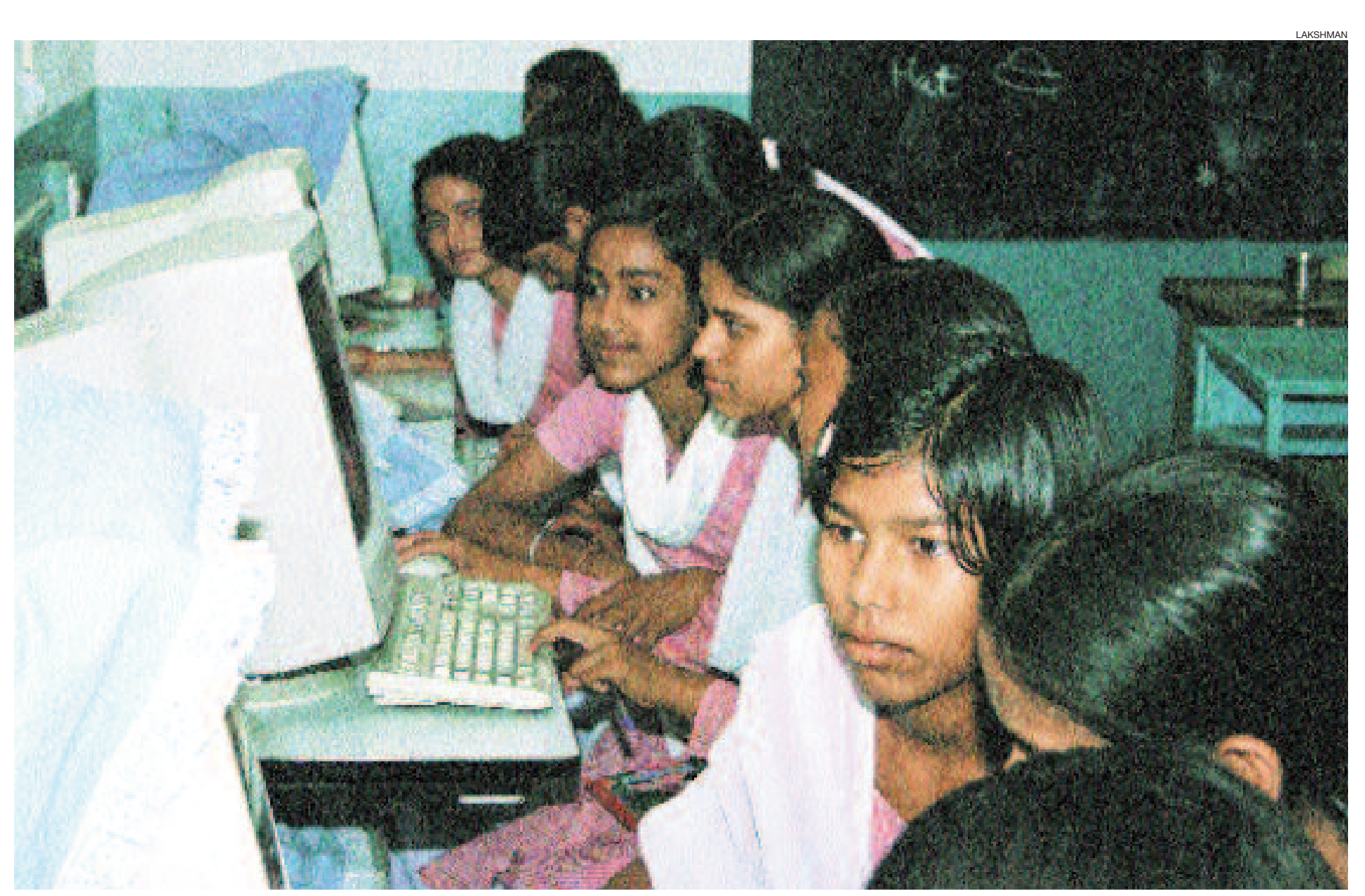
Girls at the Government High School in Carterpuri, Gurgaon, use computers provided by Hughes Software.