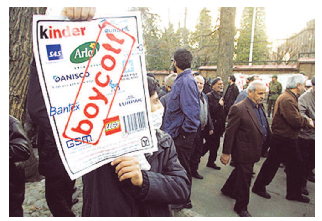
A demonstration against the Danish cartoons

It is interesting to note that police constables in the UK, then and now, are citizens locally appointed but having authority under the crown to protect communities and enforce the law. So police officers are not employees but Crown Appointees with discretion on using their powers which is unfettered - no one can order constables to exercise their powers. And so developed the concept of local men (now women as well) policing their own communities with the con-