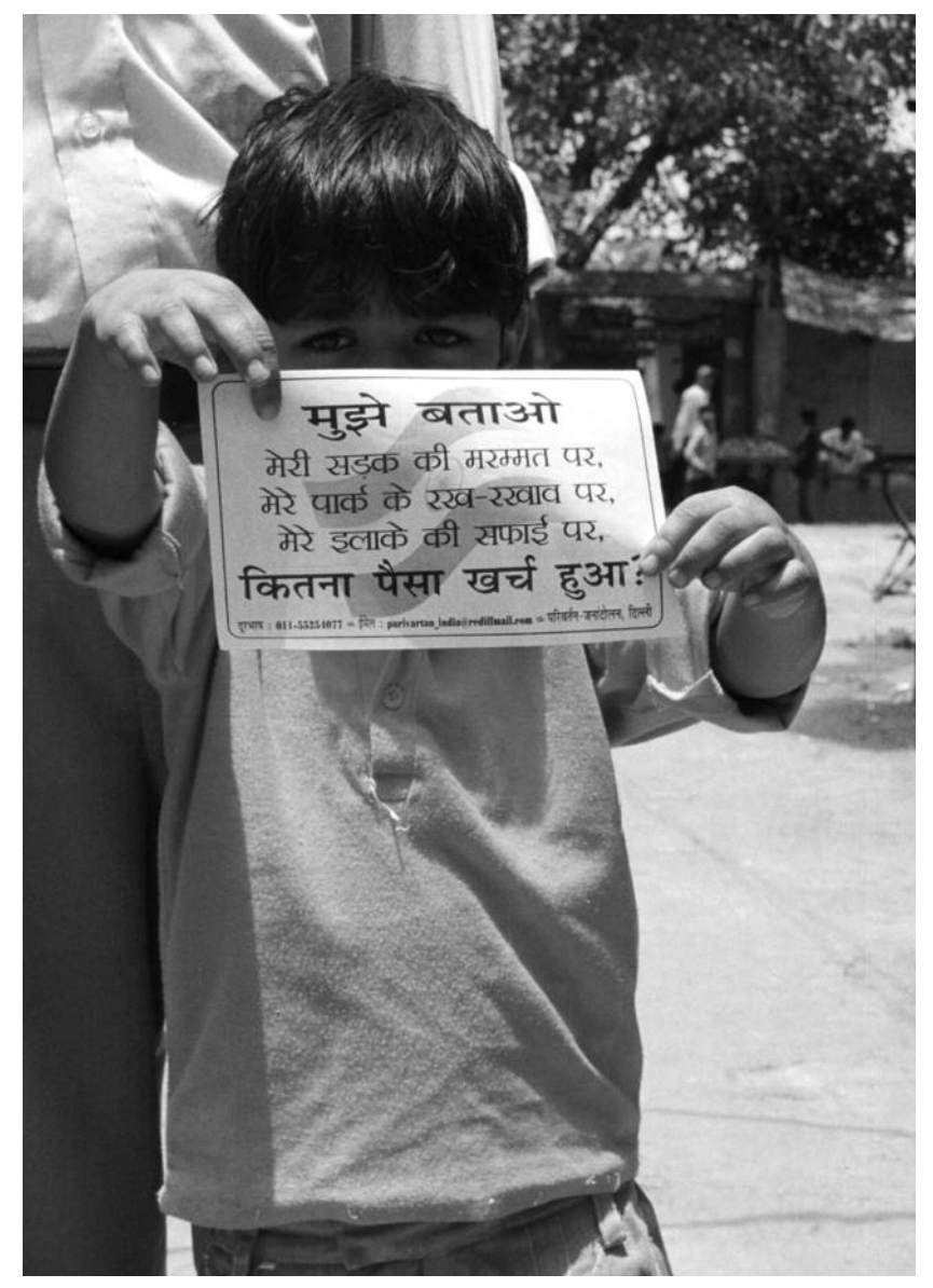
A child holding up a right to information poster in Sundernagari

The government constructed some fountains in totally decrepit parks in Sundernagari for Rs 60 lakhs. The fountains didn't work for a day. The people did not need them at all. They had been demanding sewerage, better sanitation, a post office and a secondary school for the past several years.