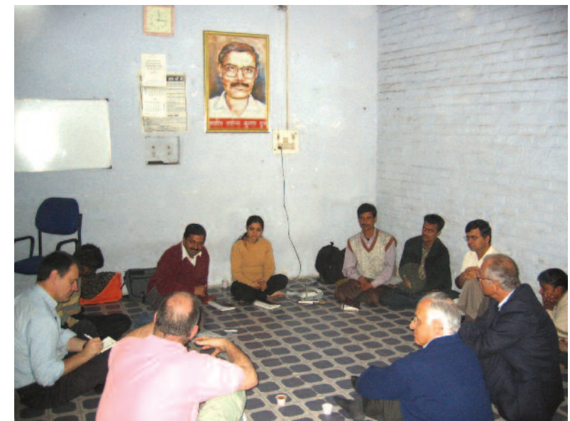
Parivartan team in Sundernagari

"Peacocks Strutting, and Little Birds Scrambling" is the scenario of the free market. It is the process of 'cumulative causation' in the growth of economies.